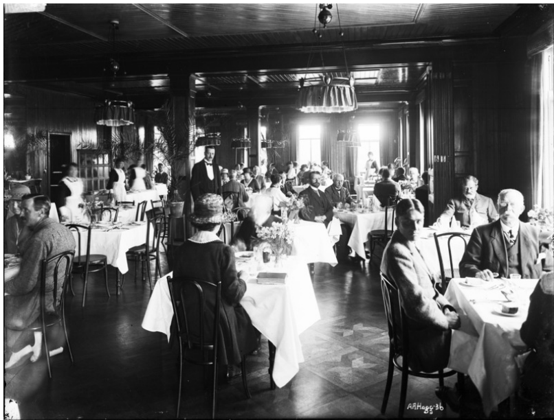
Figure 4: Rosapenna Hotel Dining Room with guests c.1919. A.R. Hogg Y654 © National Museums Northern Ireland

The A.R. Hogg photographic collection consists of glass negatives, original prints, lantern slides and photographic albums. Dating from c.1880 -1939, it holds material of topographical and industrial interest and includes a large number of named portraits. While all parts of Ireland are covered, the collection's focus is particularly strong in relation to Belfast and north-east Ulster. There are currently 109 photographs in the Hogg collection relating to Donegal.