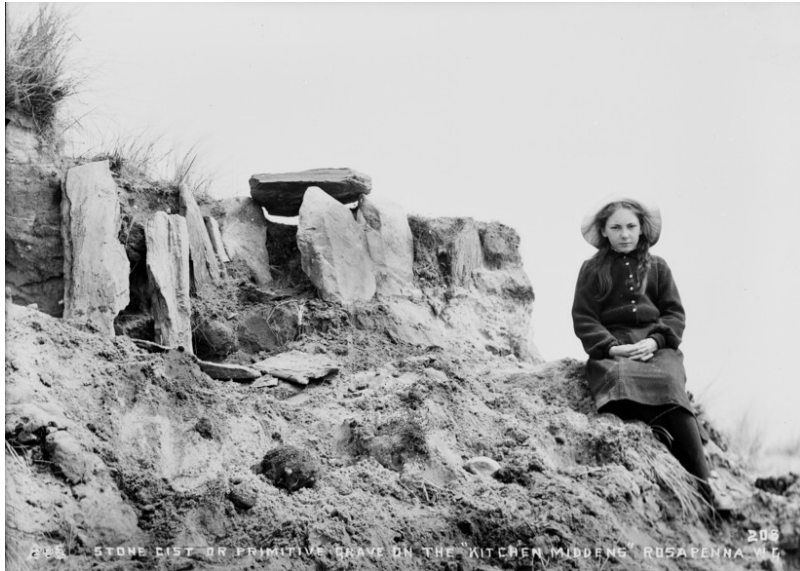
Figure 5: Stone Cist Or Primitive Grave On The "Kitchen Middens", Rosapenna. W.A. Green WAG0208. © National Museums Northern Ireland

The W.A. Green photographic collection consists of glass negatives, original prints, lantern slides and published series of views and dates from c.1880 – c.1940. It contains material of topographical, archaeological, industrial and transport interest but is particularly strong in regard to images of agriculture, rural life, crafts and pastime of the north of Ireland. There are currently 310 photographs relating to Donegal in the Green Collection.