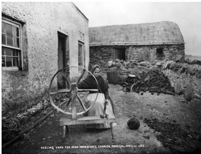
Figure 3: 'Reeling yarn for Irish Homespuns' R.J. Welch 1366 © National Museums Northern Ireland

The R.J. Welch photographic collection consists of glass negatives, original prints, lantern slides, original photographic albums and published series of views. Dating from c.1880 – c.1935, it contains material of topographical, scientific, anthropological, archaeological, transport and industrial interest, covering the whole of Ireland with particular emphasis on the north and west. There are currently 313 images in the existing Welch collection relating to Donegal.