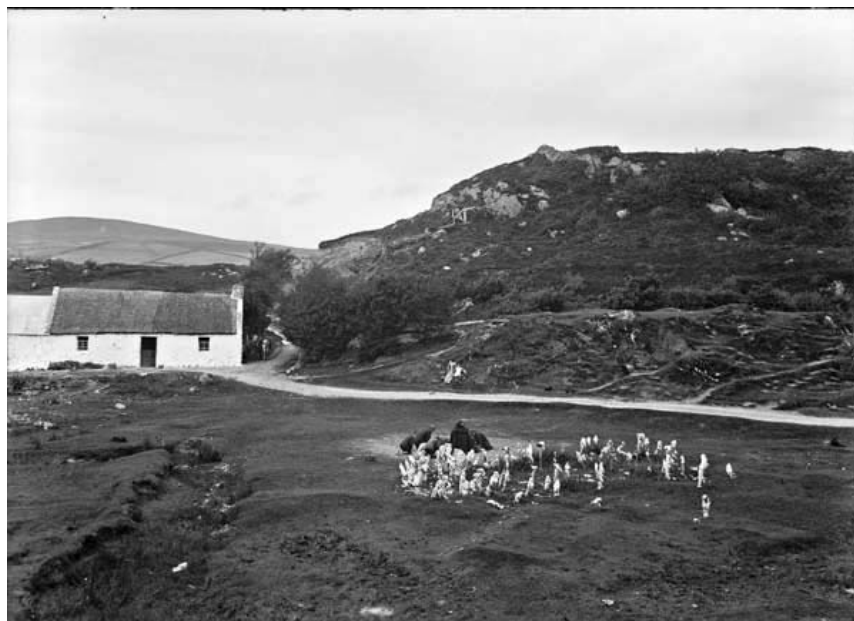
Figure 1: Doon Well, Termon (EAS_1042)

Approximately 90 of these photographs were taken in various locations throughout Donegal.