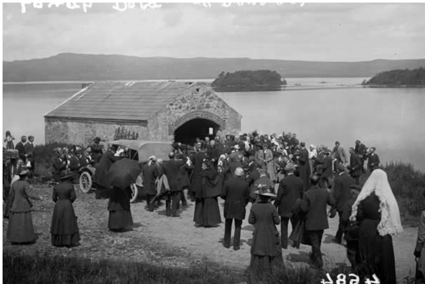
Figure 2: Lough Derg, Co. Donegal (L_CAB_04684)